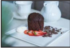
114-12 Choc Chip