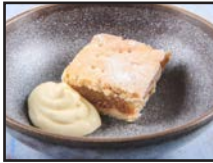
114-35 Apple Pie